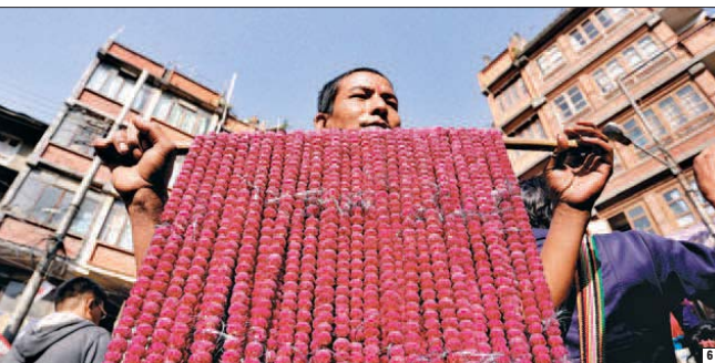
1) A vendor sells colour for Bhai Tika at Ason in Kathmandu on Sunday; 2) a vendor displays flowers for sale at Itahari in Sunsari; 3) a man makes a colourful mandala at Ason on the occasion of Laxmi Puja; 4) a couple decorate their house with marigold flowers in Kathmandu; 5) a man sells pictures of Goddess Laxmi at Ason; 6) a man sells mahamali garlands at Ason.