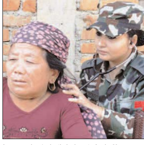
A woman undergoing health check-up at a free health camp organised by Nepal Army at Foksingkot in Palpa.