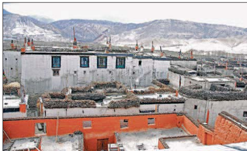
Lo Manthang in Mustang.