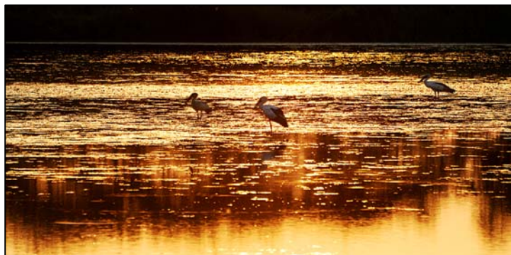
© OCHSPA – Song Yan Gang

Lumbini, the Birthplace of Lord Buddha, is within the Master Plan prepared by Kenzo Tange in 1978, was inscribed on the World Heritage List in 1997.